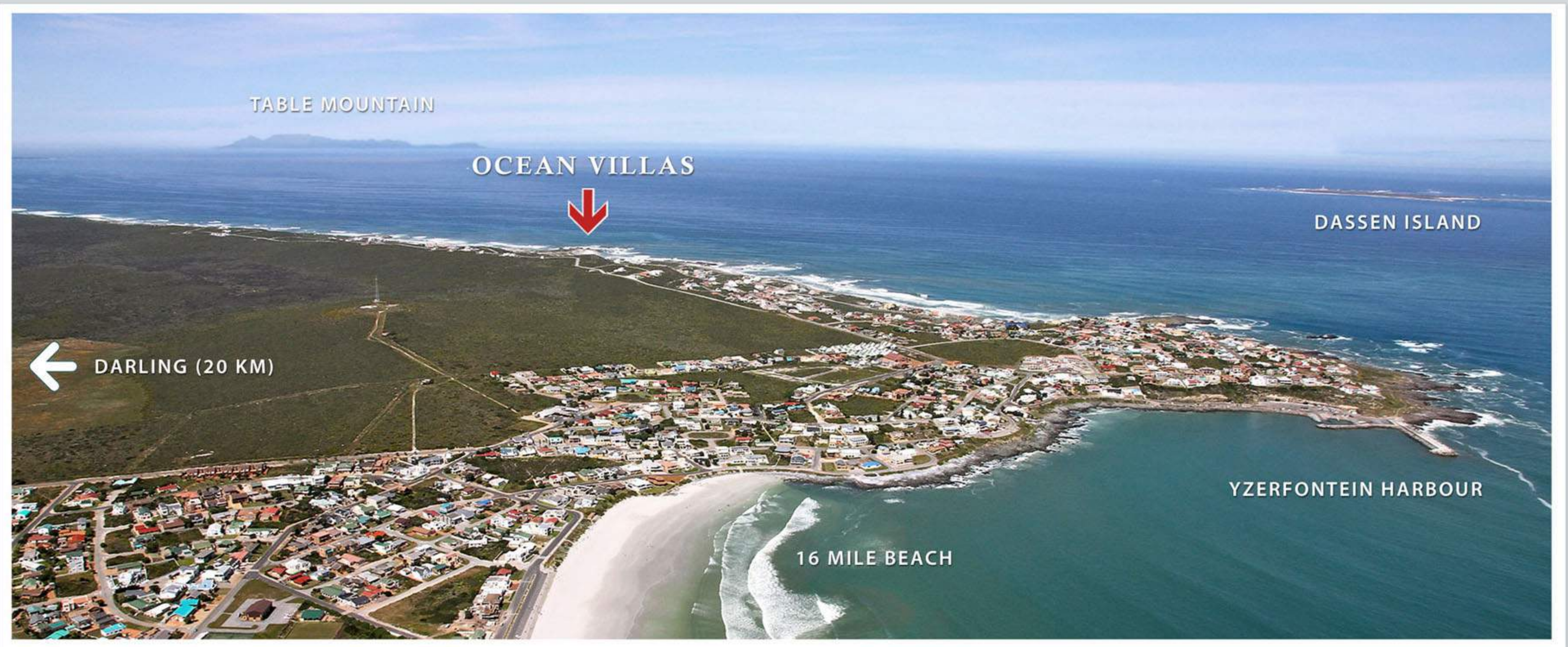
OCEAN VILLAS - SOUTH WEST VIEW