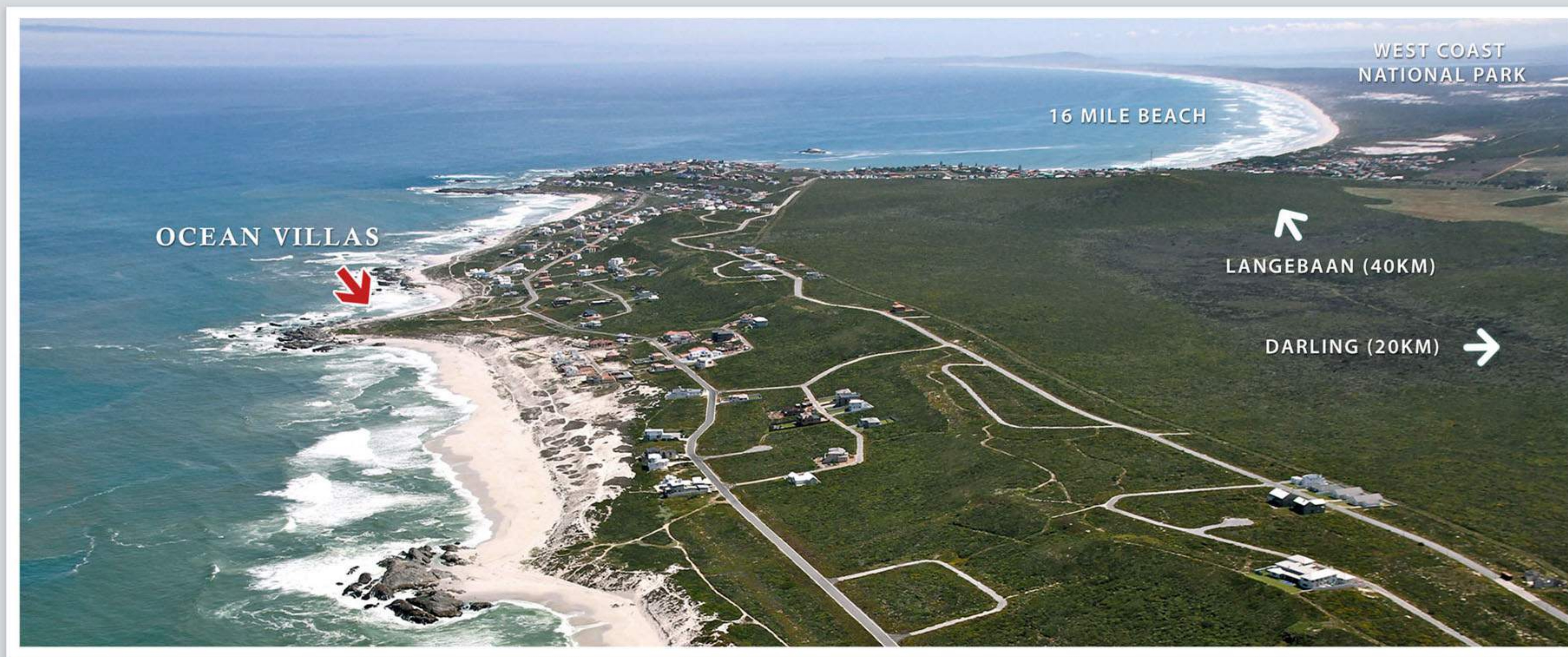
OCEAN VILLAS - NORTH WEST VIEW