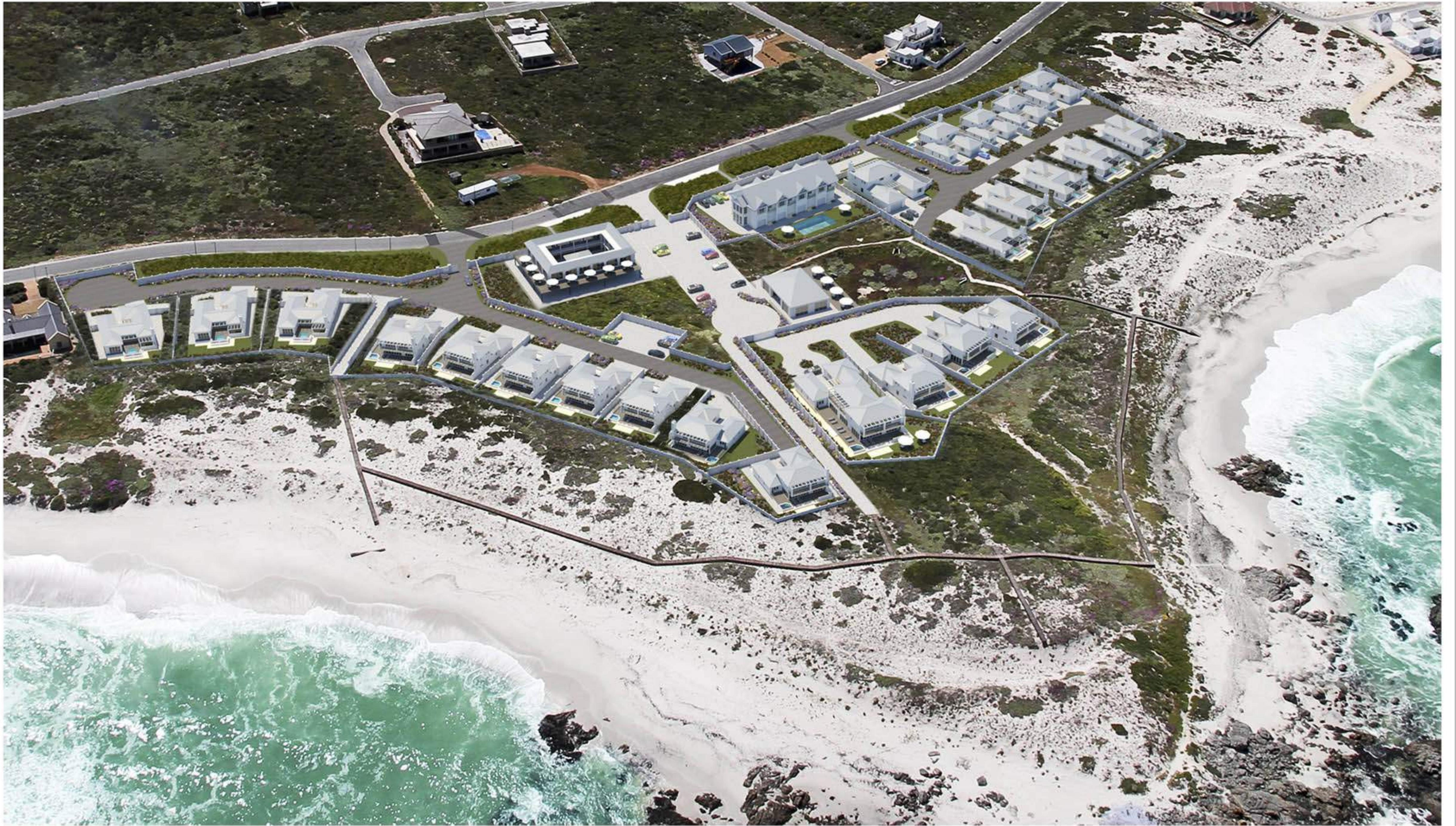
OCEAN VILLAS - PEARL BAY - YZERFONTEIN